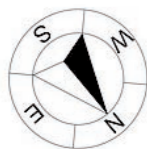
PROVSTEVEJ 17. 1TV. ORIGINAL PLAN